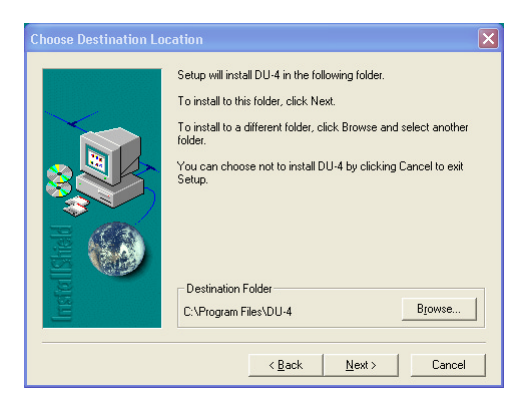
Figure 1: Choose Destination Location